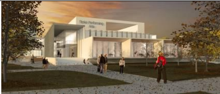
The Performing Arts Centre; a shared facility to be based at Stoke-on-Trent College's Cauldon site