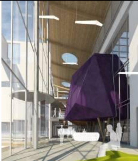
The stunning glass fronted atrium at City of Stoke-on-Trent Sixth Form College's new building