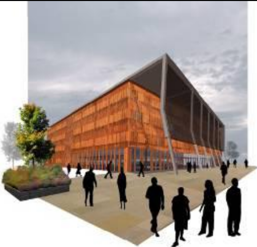
An artist's impression of Staffordshire University's Science Centre which will be a shared facility