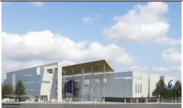
City of Stoke-on-Trent Sixth Form College's state of the art new building