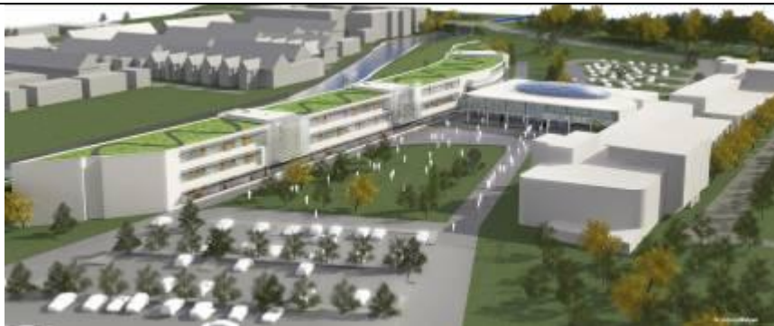
A panoramic view of Stoke-on-Trent College's planned new Cauldon site