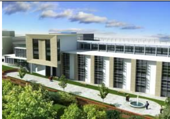
Centre of Excellence for Caring and Service Industries at Stoke-on-Trent College

If you require images of the University Quarter, please log on to www.uniq-stoke.com/media_gallery.html for a selection of high resolution pictures available for download.